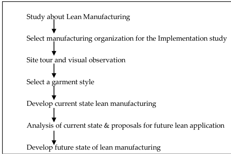
Fig-1 Research approach- steps by steps process

The steps considered in the process are given below.