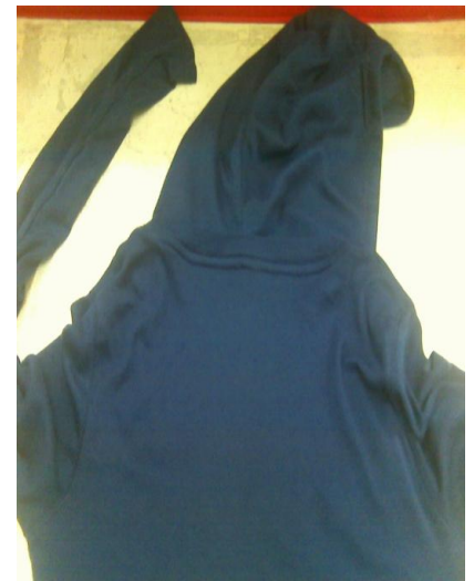
Fig 3 Front & back view of long sleeve hoody (women's wear) (Experimental Garments product)

A typical experimental data of operational breakdown with variable SMV output is given below.