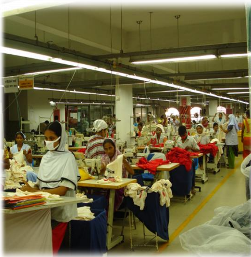
Fig.2 General Overview of the garments sewing Section of Viyellatex Group